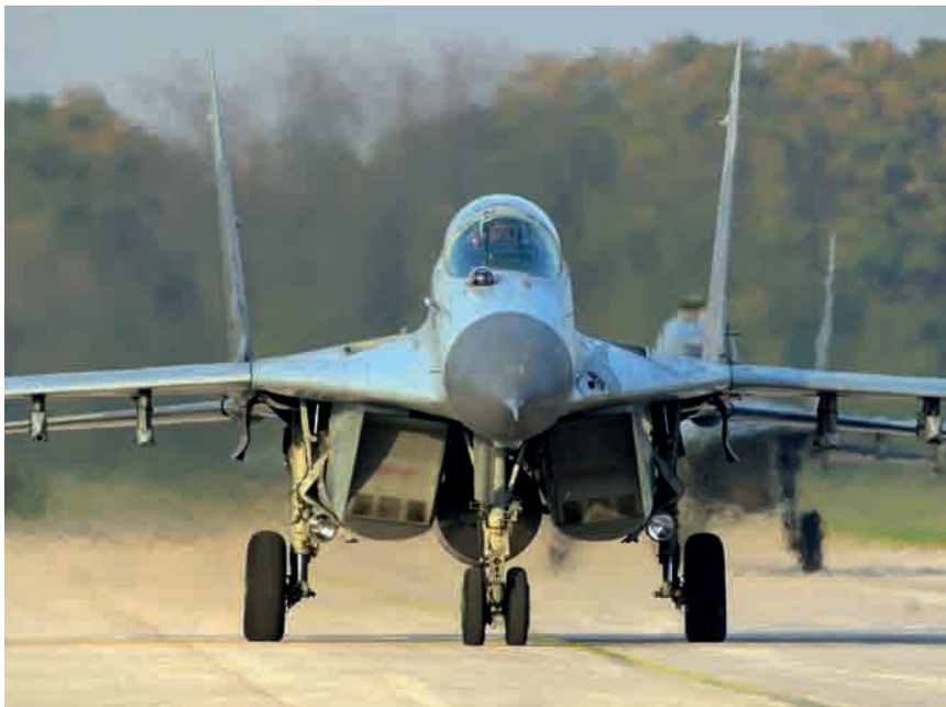
Our data records 793 MiG-29 fighters as being in active duty, including four in Serbia