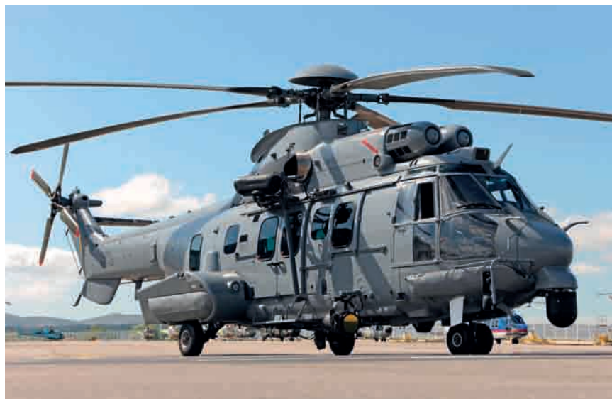
The Royal Malaysian Air Force has 12 combat search and rescue-ruled EC725s in use