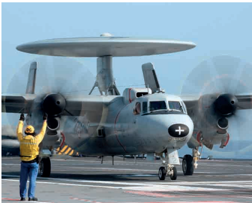
E-2C Hawkeyes are deployed aboard the French navy aircraft carrier Charles de Gaulle