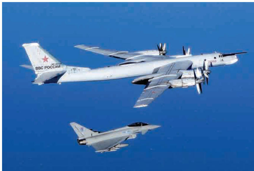
Russia's activities with its Tu-95 bombers have tested the response of NATO allies

Despite lingering flight envelope restrictions imposed following an engine fire which badly damaged an A-model aircraft on the ground earlier in the year, the F-35 programme received a subsequent boost, with the confirmation of a $4.7 billion, eighth low-rate initial production deal to produce 43 of the aircraft; with a related engine package yet to be finalised. The USA succeeded in getting orders from three of its partner nations – Italy, Norway and the UK – as part of the contract, plus from export customers Israel and Japan.