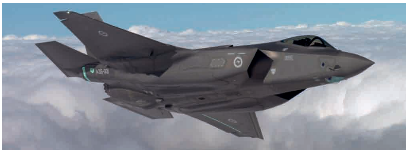
The Royal Australian Air Force's first F-35A pilots will start training on the Lightning II at Luke AFB, Arizona, in early 2015