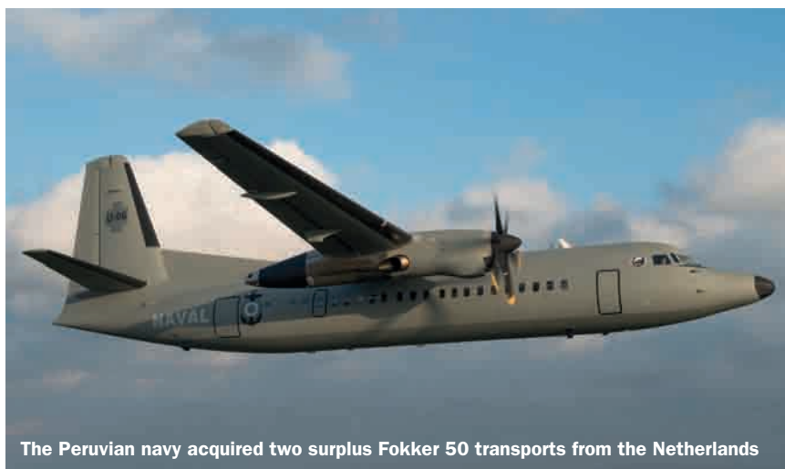
The Peruvian navy acquired two surplus Fokker 50 transports from the Netherlands