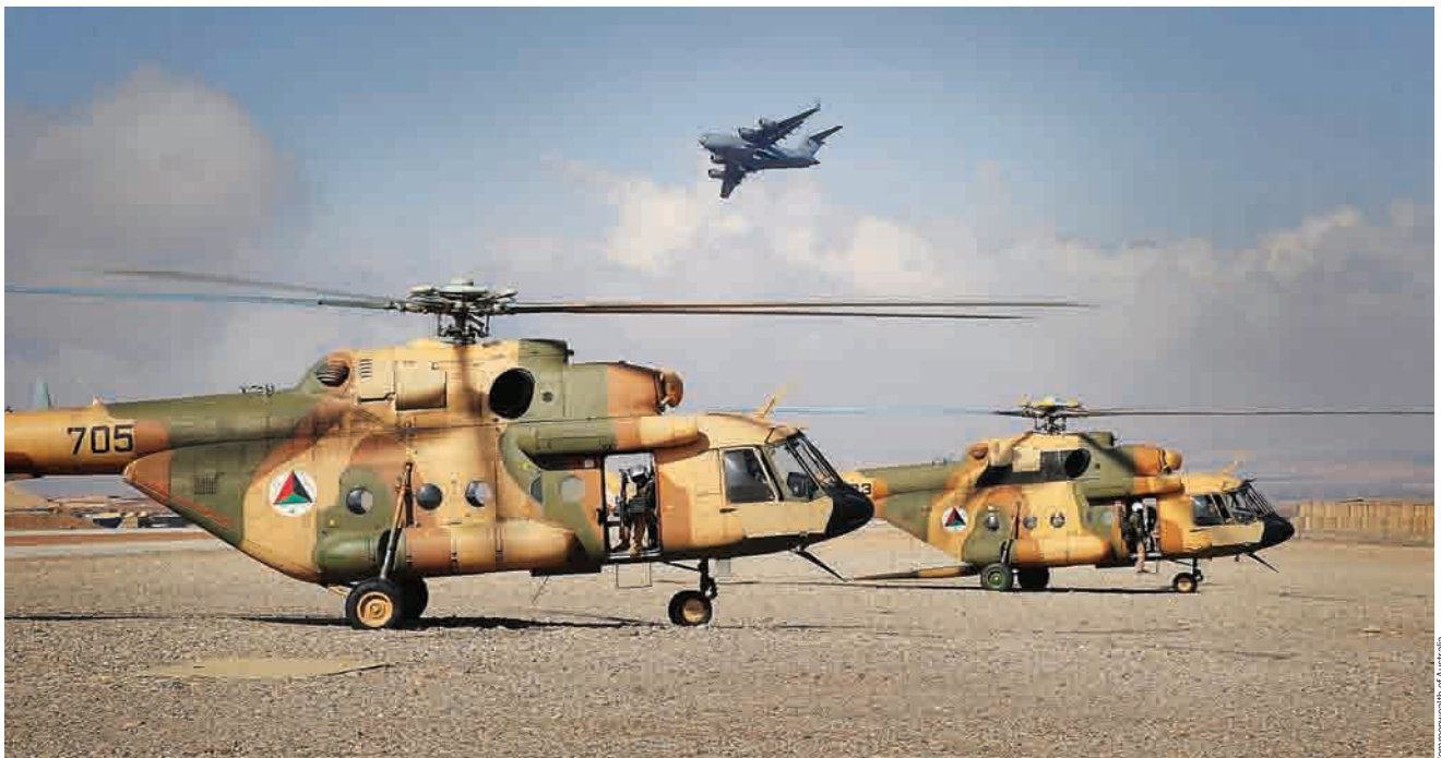
Kabul's fledgling armed forces have assumed responsibility for national security, as a coalition of NATO nations has left Afghanistan

Ongoing fleet renewals also led to some notable retirements, including that of the French air force's final Dassault Mirage F1s. The act leaves just 32 combat examples and four trainers as operational in Gabon, Iran, Libya and Morocco. Oman also during 2014 ceased operations with the Sepecat Jaguar, leaving >>