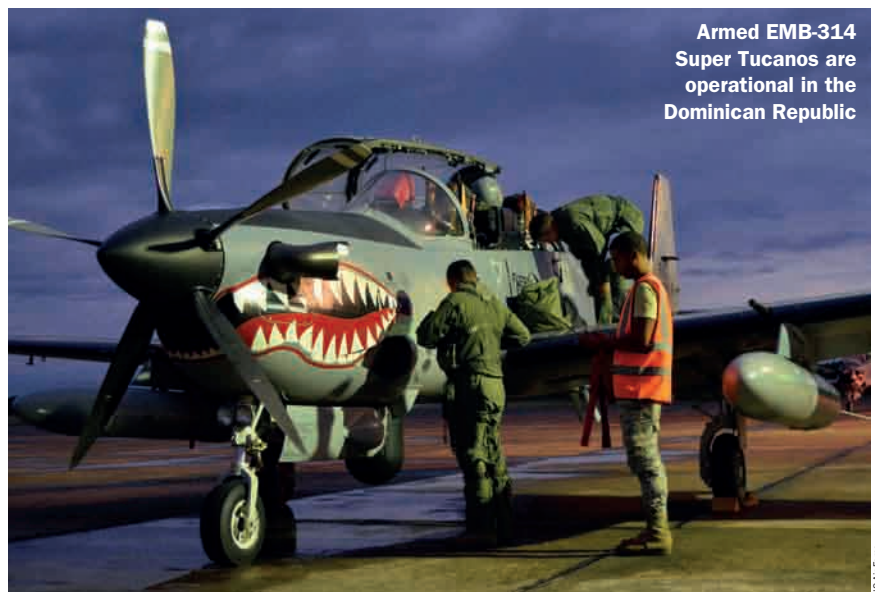
Armed EMB-314 Super Tucanos are operational in the Dominican Republic