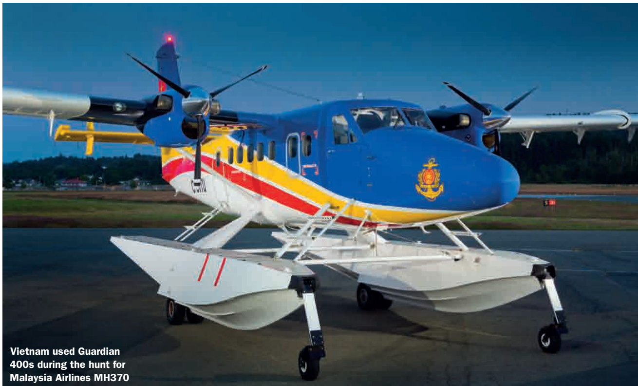
Vietnam used Guardian 400s during the hunt for Malaysia Airlines MH370