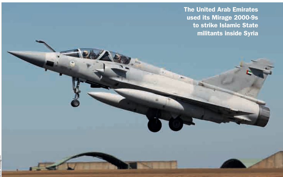
The United Arab Emirates used its Mirage 2000-9s to strike Islamic State militants inside Syria