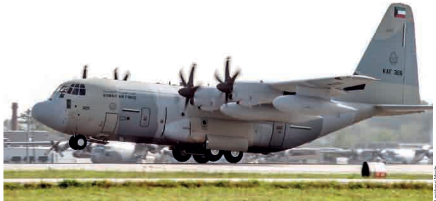
Kuwait has an option to add to its trio of newly-delivered KC-130J tankers