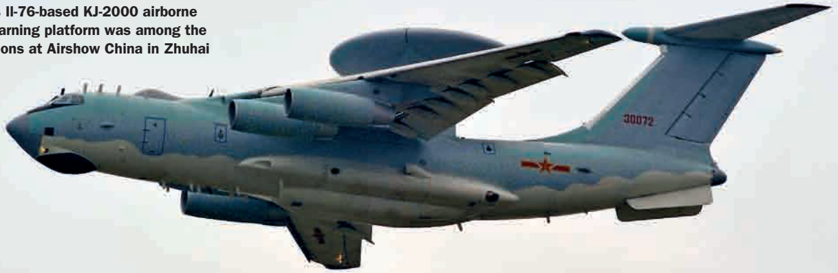
China's Il-76-based KJ-2000 airborne early warning platform was among the attractions at Airshow China in Zhuhai