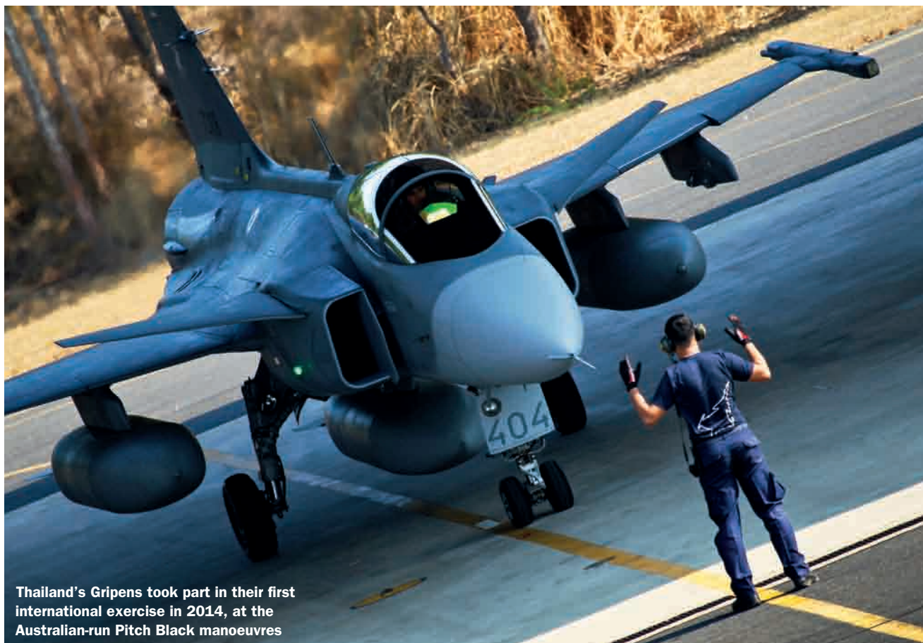
Commonwealth of Australia